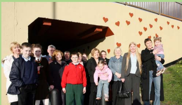
(Picture - Families involved in the project - taken by Andersonstown News)

In conjunction with the opening of the St. Lukes Celebration of Life Garden in November 2006 the nearby underpass was refurbished. The garden represents the young people from the Colin area that lost their lives in tragic circumstances, and the idea was to carry the