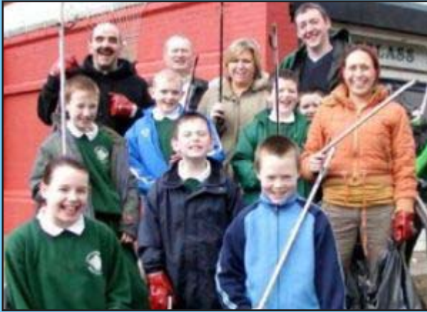
(Picture - Staff of The Colin Neighbourhood Partnership with local children from St Kierans School)

As part of the St Patrick's day programme the Colin Neighbourhood Partnership, Lisburn City Council, NIHE, Conservation Volunteers Northern Ireland, shop owners and local children from St Kierans School participated in a clean up of the Laurelbank Shops in the Poleglass estate.