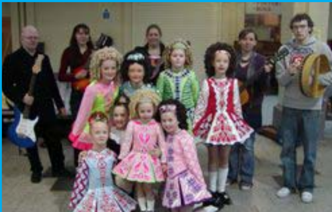
(Picture - Children from Green School of Irish Dance and tutors from Andersonstown School of Music)

An array of activities were held in the Colin Area over St Patrick's Week including Irish dancing exhibitions, Ceili's, and traditional music workshops.